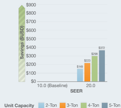
Annual Energy Cost Savings for Cooling 10.0-SEER Baseline*

*Most commonly replaced system. Energy savings shown are calculated per AHRI (Air Conditioning, Heating, and Refrigeration Institute) annual operating costs and represent directional numbers most applicable to typical cooling and heating requirements within the mid-latitudes of the U.S.